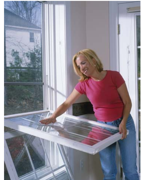
Tilt-in top and bottom sash for easy cleaning

Our sleek fully welded sash and frame design provides a one-piece sloped sill and better performance than ordinary vinyl windows, with an air-tight seal that keeps wind and water where they belong - outside. Consult your professional contractor to discuss which options best match your needs.